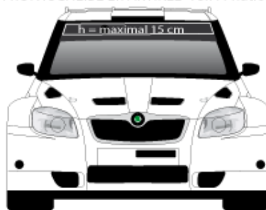
FRONTSCHIEBE LT. ARTIKEL 18.7.4 national